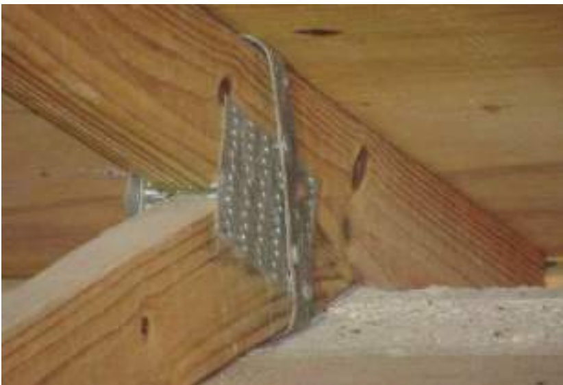
Single wrap with at least 2 nails on the embedded side and at least 1 nail on the wrapped side